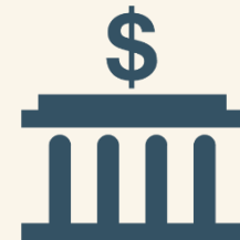
Anyone who Wants to Know about Tax Breaks