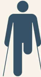
People with Disabilities