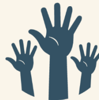
Parents of Children with Special Needs (Learning disabilities, Autism...)