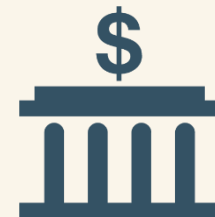
Anyone who Wants to Know about Tax Breaks