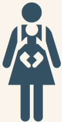
Single Parent Families, Veterans, Anyone with Chronic Disease